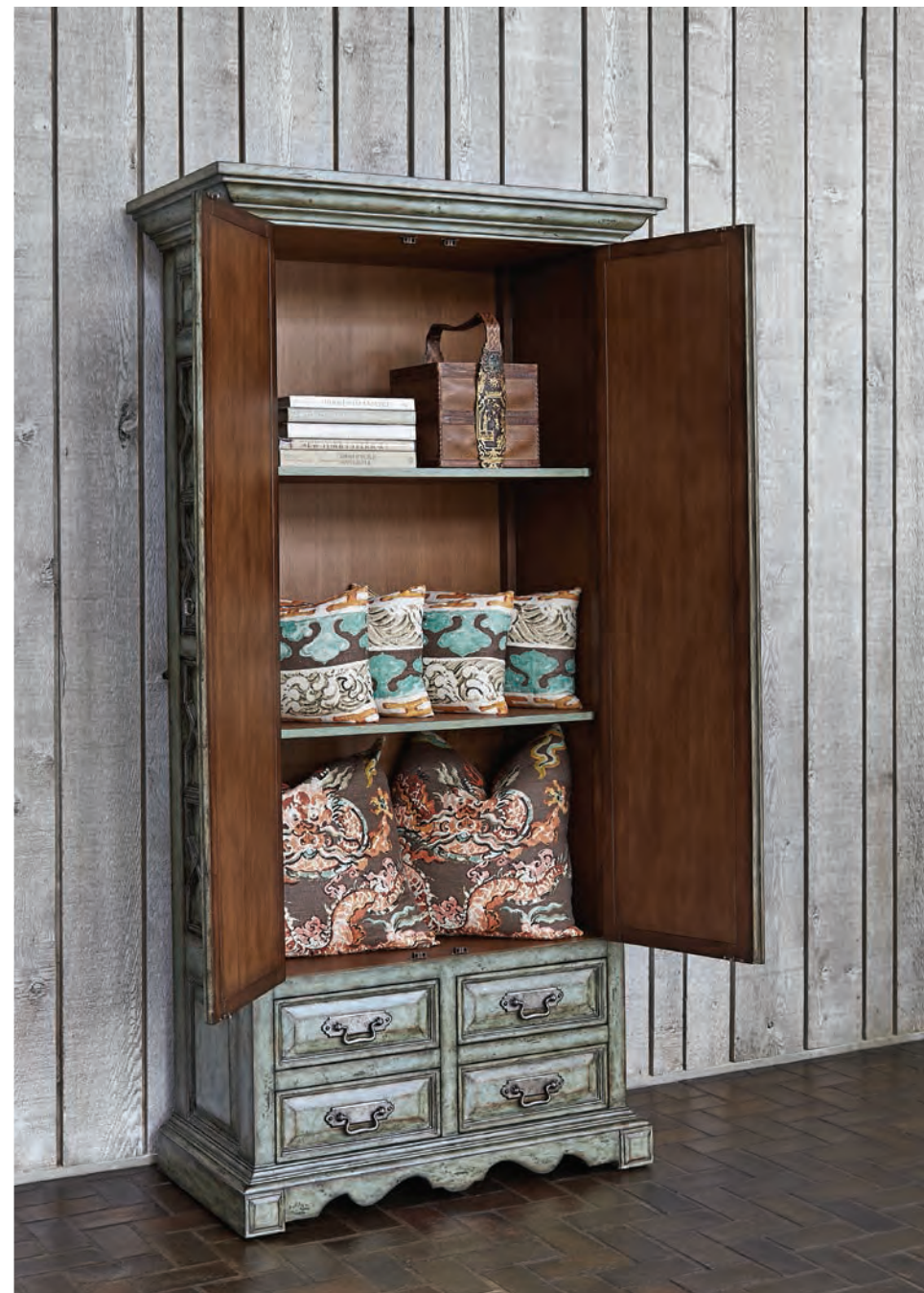
06689-820-001 MEDALLION TALL CABINET - ANTIQUE BLUE