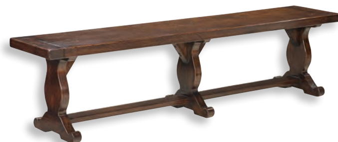
17513-710-001 FARMHOUSE DINING BENCH

W:73.5" x D:15" x H:18.5" Solid European white oak bench with a hand-rubbed wax/oil finish.