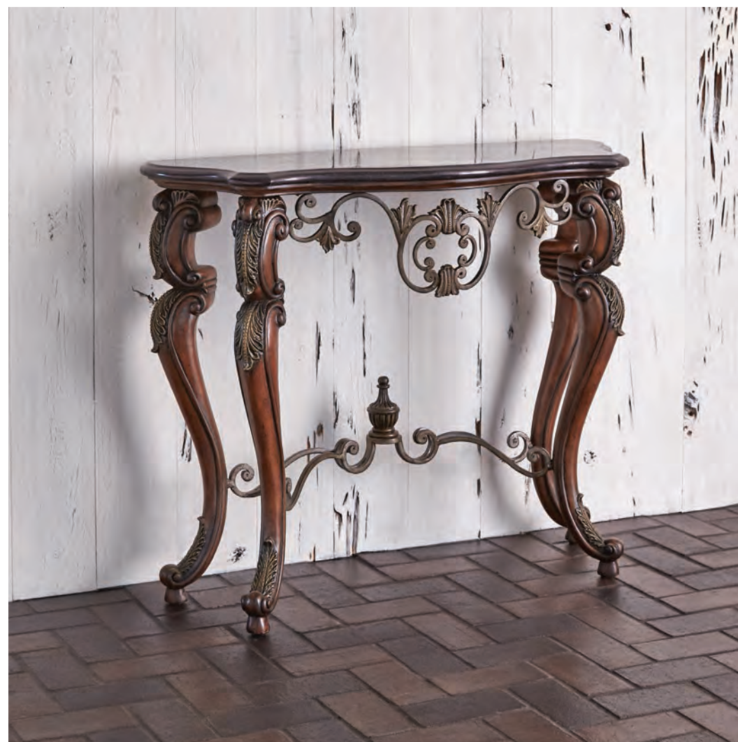
07077-850-001 GOLDEN DEBUSSE CONSOLE

Antique iron base with gold metal accents. Leather top.