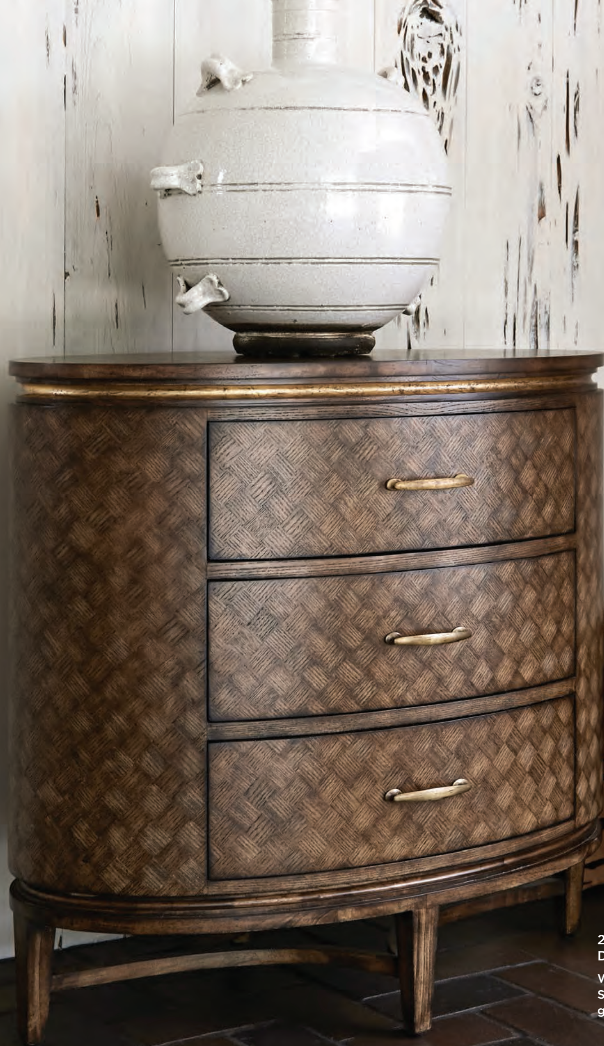
24063-830-001 DOVER OVAL CHEST

W:34" x D:18" x H:32" Solid mindi wood with white ash parquetry, gold accents, brass pulls and metal drawer glides.