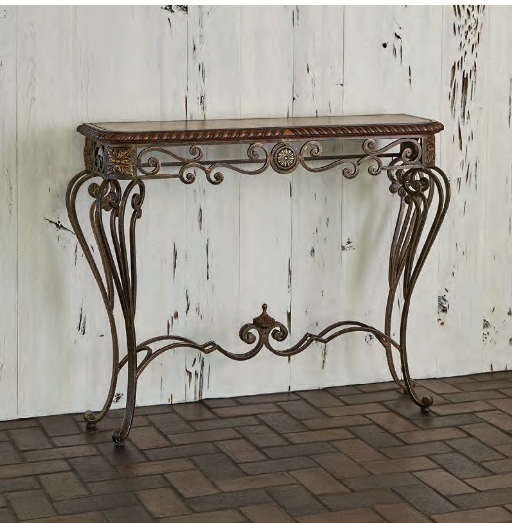
05120-850-001 HANOVER CONSOLE