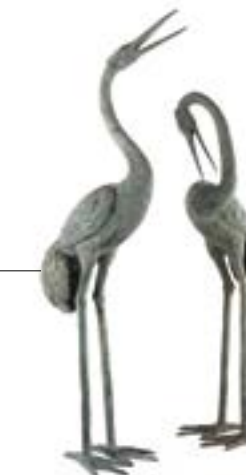
OBJ-256BA / OBJ-256BAA HERON Big decorative herons in bronze with natural finish. 60 x 40 x h 260 cm 60 x 40 x h 220 cm