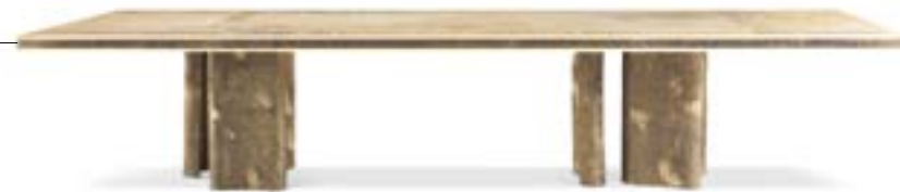
SHI-14-2B SHINTO Dining table with sculptural bases in lost-wax casted brass, antique bronze finishing. Top in maple wood and Cloudy onyx with brass profiles. 400 x 140 x h 79 cm