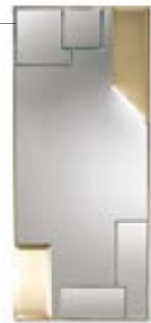
DEC-12 DECÒ Mirror with structure in brass and bevelled mirrors. Lighting system. 82 x 3 x h 190 cm