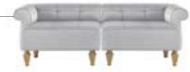
MUS-07BDX / MUS-07BSX MUSA

Right and left benches with structure in beech solid wood and foam. Upholstery in fabric MIL 19.06. Feet finished in antique gold with patina J2880.