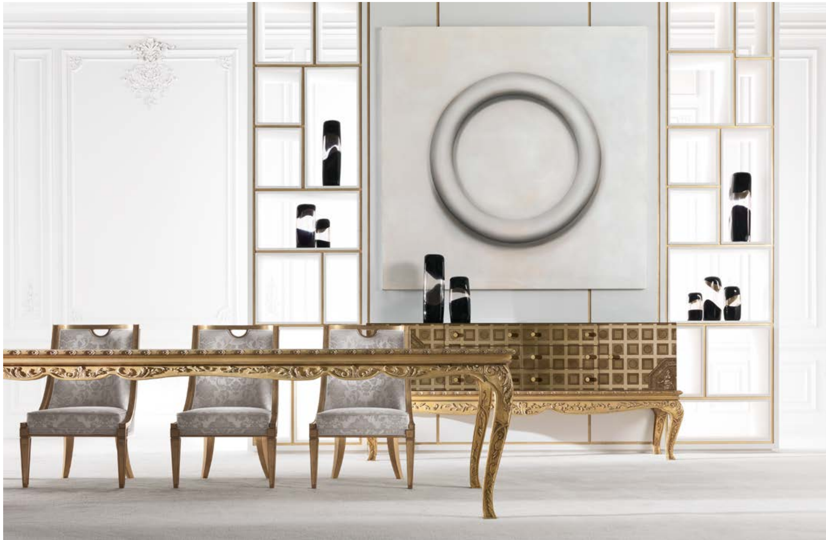
FRAGONARD DINING TABLE CHAIRS SIDEBOARD