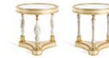
TOU-47B / TOU-147 TOULOUSE

Side tables with structure in multilayer maple wood. Top in white marble. Profile and details in antique gold with patina JG294. Bisquit porcelain statues. Also available with neoclassical columns (TOU-147). Lost-wax casted brass details. ø 66 x h 66,5 cm