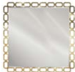
ETO-12B ETOILE Mirror with structure in brass. Bevelled mirror. 155,5 x h 155,5 cm