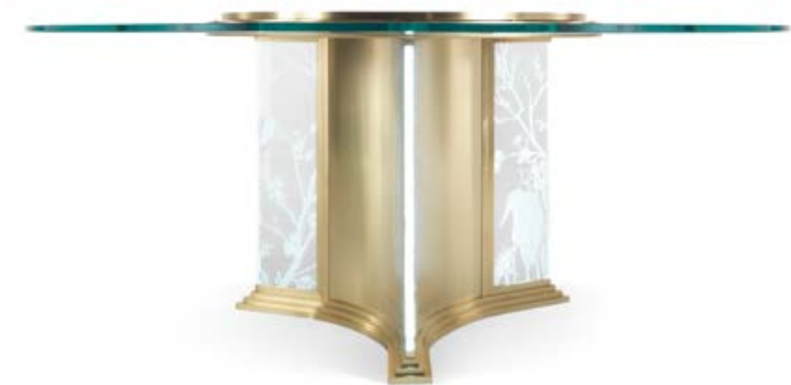
FUJII DINING TABLE