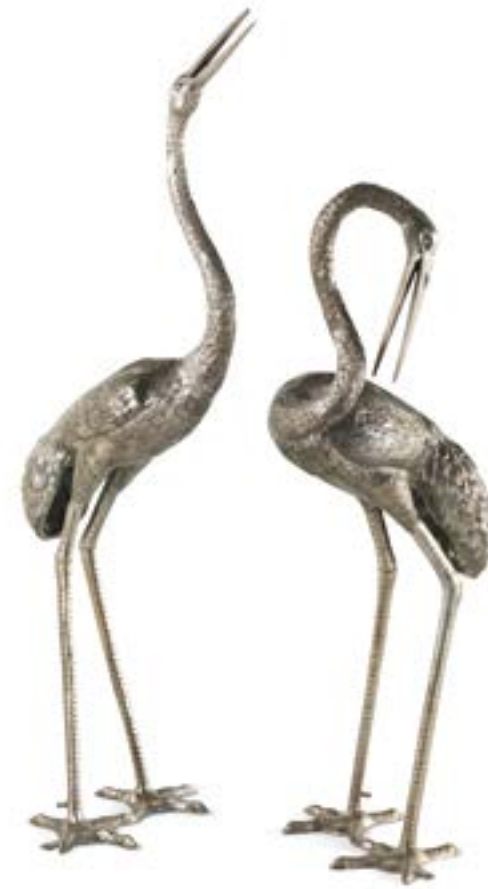
HERON SMALL BRONZE HERONS