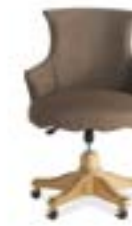
RIV-35 RIVOLI Swivel armchair with structure in poplar solid wood and foam. Upholstery in Brown Nabuk. Base in antique gold with patina J2880. 73 x 80 x h 109 cm