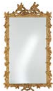
CHAB-12 CHABLIS Mirror with structure in hand-carved beech wood finished in gold with patina J2910. Bevelled mirror. 107 x h 185 cm