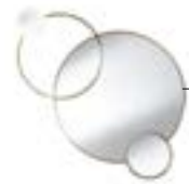
SPI-04B SPIRITOS Mirror with structure in brass and bevelled mirrors. Lighted sphere lamp. 97 x 24 x h 102 cm