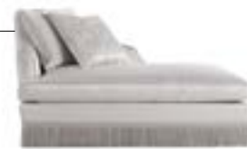
WHE-58DX / WHE-58SX WHEIDON

Right or left chaise longue with structure in poplar solid wood and foam. Upholstery in fabric MIL 19.10 with embroidery in relief.