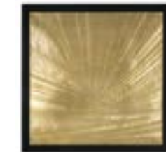
FRA-123A / FRA-123B FRAGONARD Gypsum decorative panels. 90 x h 250 cm (each)