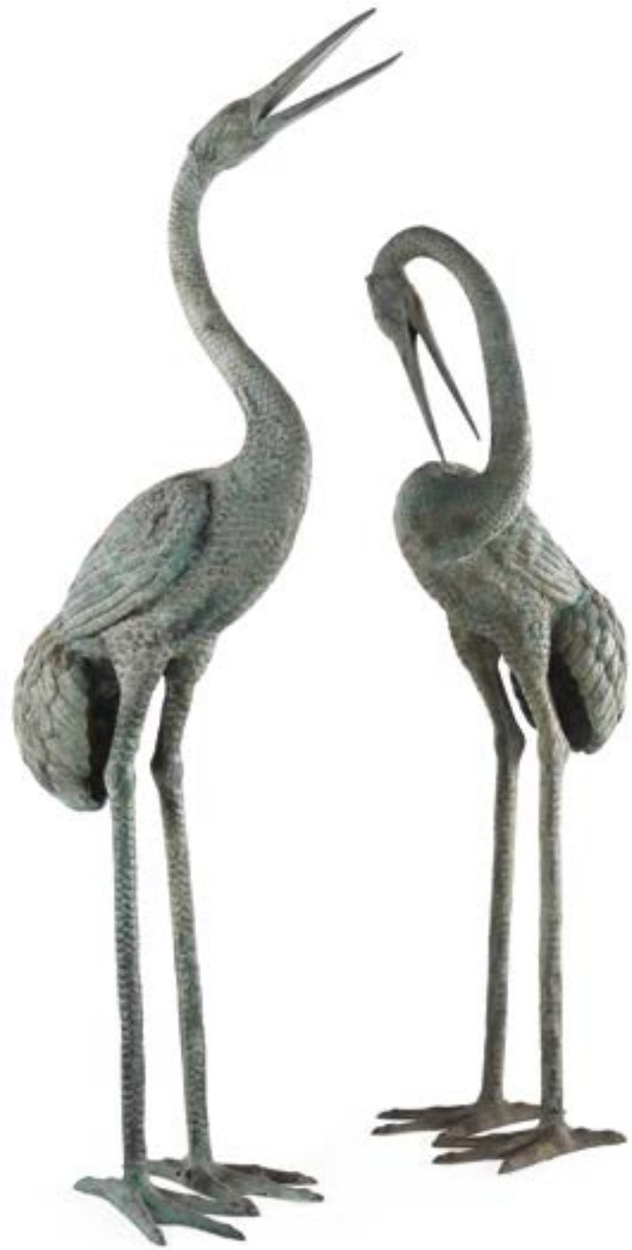
HERON BIG BRONZE HERONS

Nature as a vision and a primary inspiration. The Heron, a regal bird full of wisdom, is transformed in a bronze sculpture: a scenographic element symbolizing stillness and tranquillity, but also determination and opportunity.