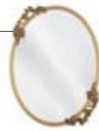
MAL-04 MADELEINE Mirror with structure in casted brass. Natural mirror. 60 x h 83 cm