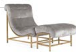
MAR-51 / MAR-58 MARQUISE

Armchair and foot-rest with structure in bronzed brass and foam. Upholstery in fabric MIL 18.09.