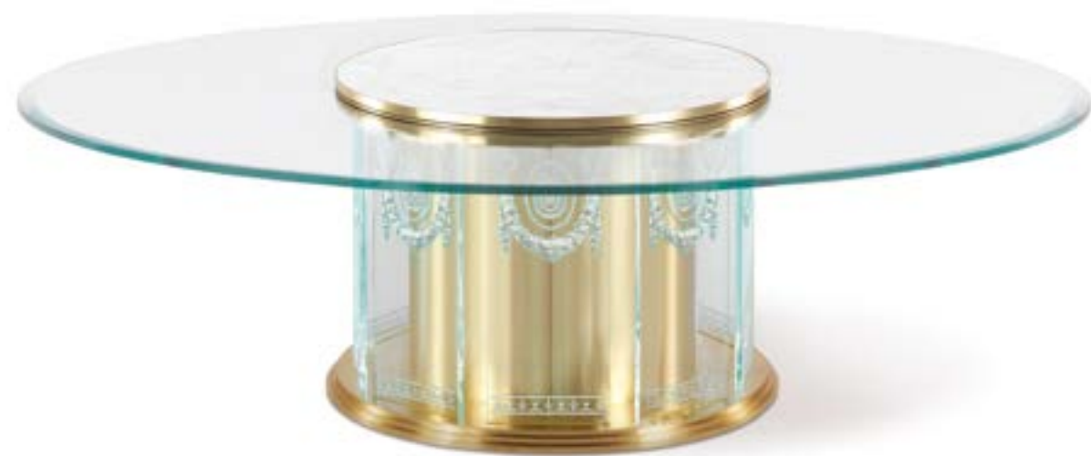
FUJI DINING TABLE