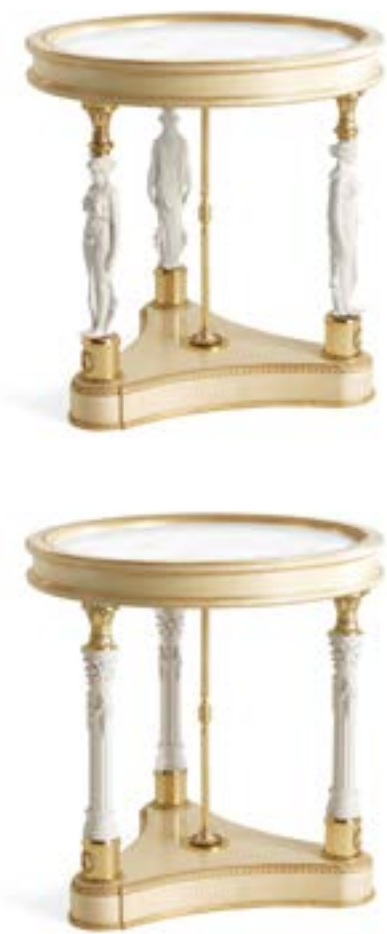
TOULOUSE SIDE TABLES

An elegant line that perfectly expresses the spirit of the 2019 collection, through a wise combination of quality materials and high level of craftsmanship. The main feature is the presence of caryatids or classical columns, made of porcelain with biscuit finish, lending the sculptures a matte appearance and texture to the touch.