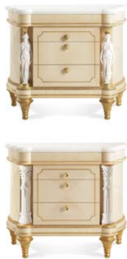
TOULOUSE NIGHT TABLES