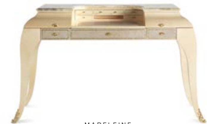
MADELEINE DRESSING TABLE