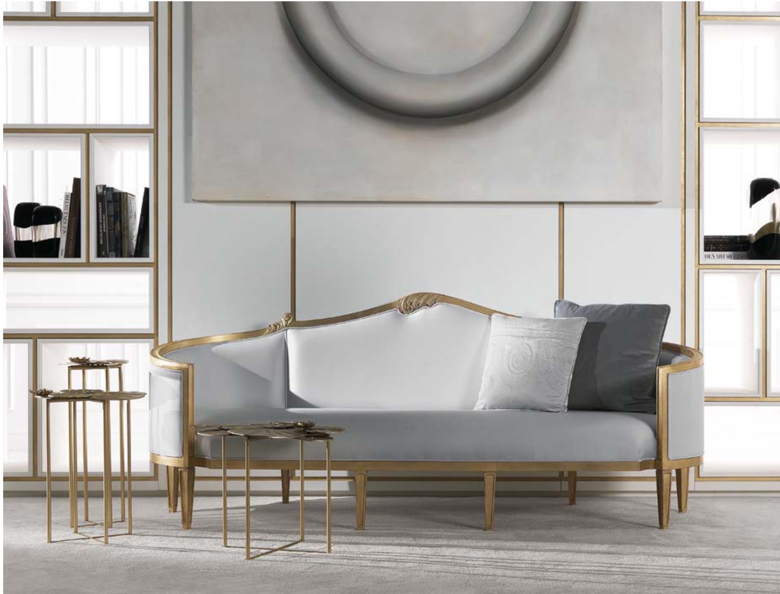
ANNECY LOVE SEAT MONET SIDE TABLES