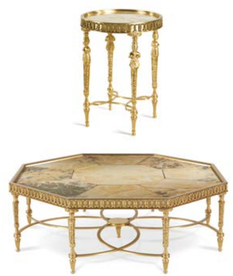
LUMIERE SIDE TABLE LUMIERE CENTRAL TABLE

An elaborate brass structure with eight skilfully chiselled legs and a play of curving lines that intersect creating a flower-shaped element with a central element in Cloudy onyx. That's the artistic base that holds the octagonal top in precious grey onyx. A Louis XVI style piece of furniture creatively revisited in a brighter, contemporary version.