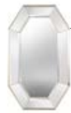
OCT-04B OCTOGONE Mirror with structure in metal and bevelled mirrors. 70,5 h 120,5 cm