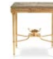
SHO-47 SHOGUN Console with structure in lost-wax casted brass. Wooden legs with glossy gold finishing. Top in Cloudy onyx. 78 x 48 x h 90 cm