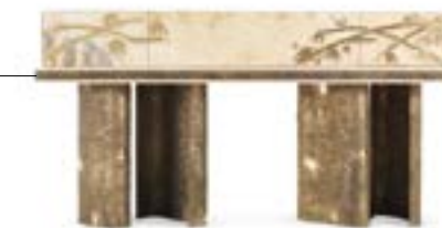
SHI-21 SHINTO Console with structure in wood covered with Cloudy onyx with gold leaf decorations. Sculptural bases in casted brass with antique bronze finishing. 198 x 48 x h 99 cm