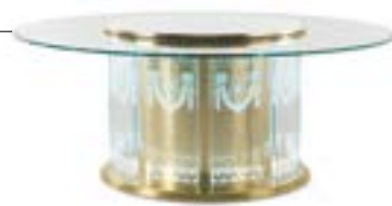
FUJ-114R FUJI Dining table with structure in brass and engraved glasses with Greek classical decorations. Top in bevelled glass with rotating lazy susan in lightened white marble. Lighting system. ø 250 x h 82 cm ø 200 x h 82 cm