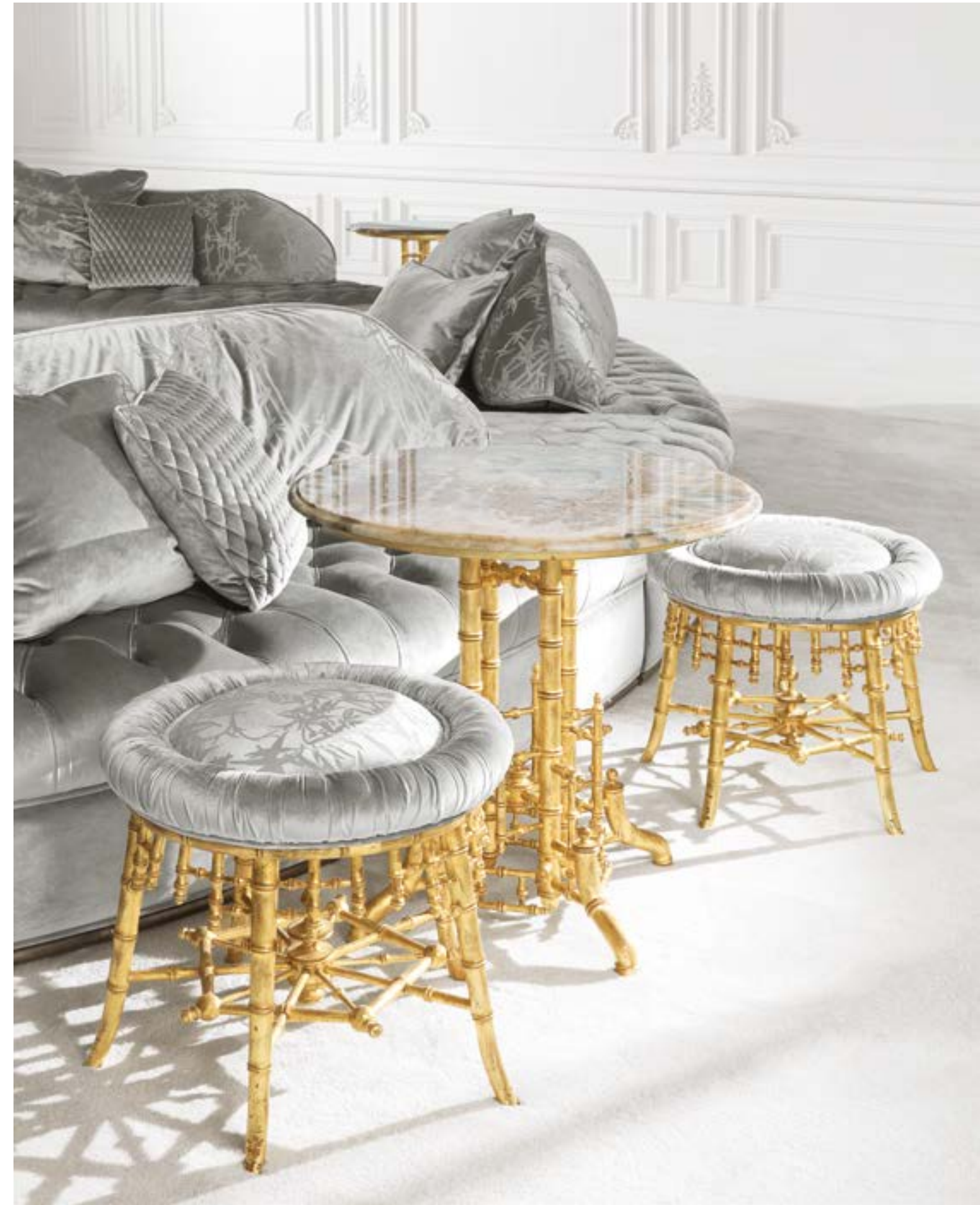
TOKYO MODULAR SOFA HIROKO POUF SIDE TABLE OSAKA CEILING LAMP