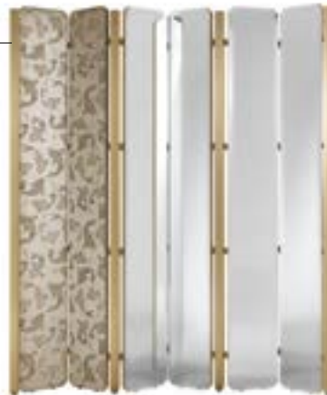
MAL-23 MADELEINE Screen with structure in multilayer wood panel and bevelled mirrors. Upholstery in fabric MIL 18.14. Brass frame. 212 x h 250 cm