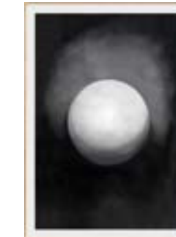
PAI-RING RING Oil painting with frame. 250 x h 250 cm