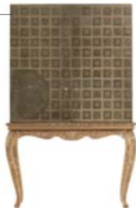
FRA-13 / FRA-33 FRAGONARD Cabinet/bar unit with structure in beech solid wood. Base in hand-carved beech wood, finished in antique gold with patina JG295. Upper part with Renaissance decorative elements made through liquid metal. 132 x 50 x h 208 cm