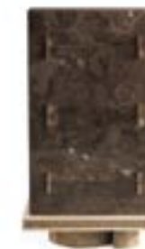
SHI-24 SHINTO Tall chest of 6 drawers with structure in wood covered with Brown Damasco marble. Sculptural base in casted brass with antique bronze finishing. 71 x 50 x h 113 cm