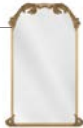
MAL-104B MADELEINE Mirror with structure in casted brass. Natural mirror. 85 x h 130 cm