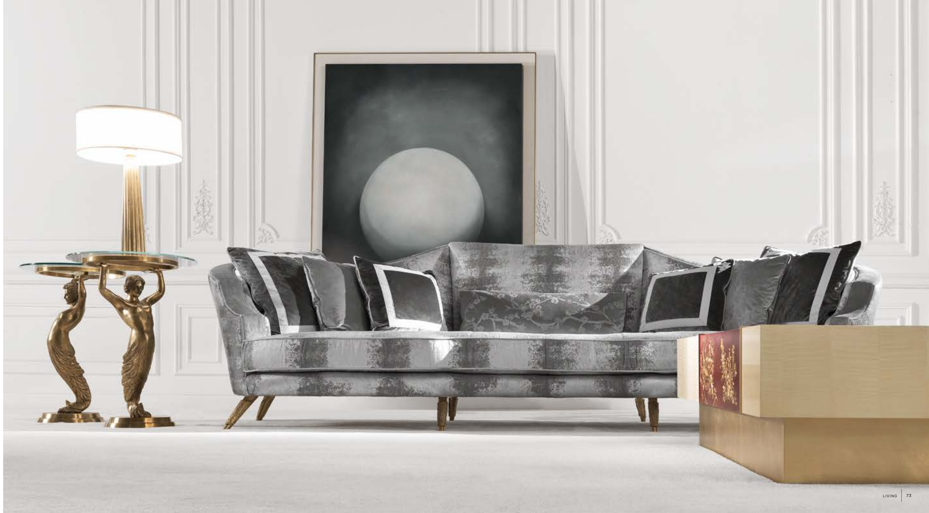
SHOGUN SOFA UKIYO CENTRAL TABLE FAUNO SIDE TABLES AISA TABLE LAMP SPHERE OIL PAINTING