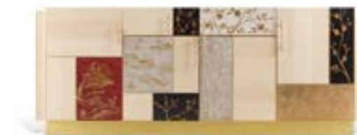
SHI-18 SHINTO TV holder with structure in wood covered with Cloudy onyx and with gold leaf decorations. Sculptural bases in lost-wax casted brass, antique bronze finishing. 187 x 48 x h 71 cm