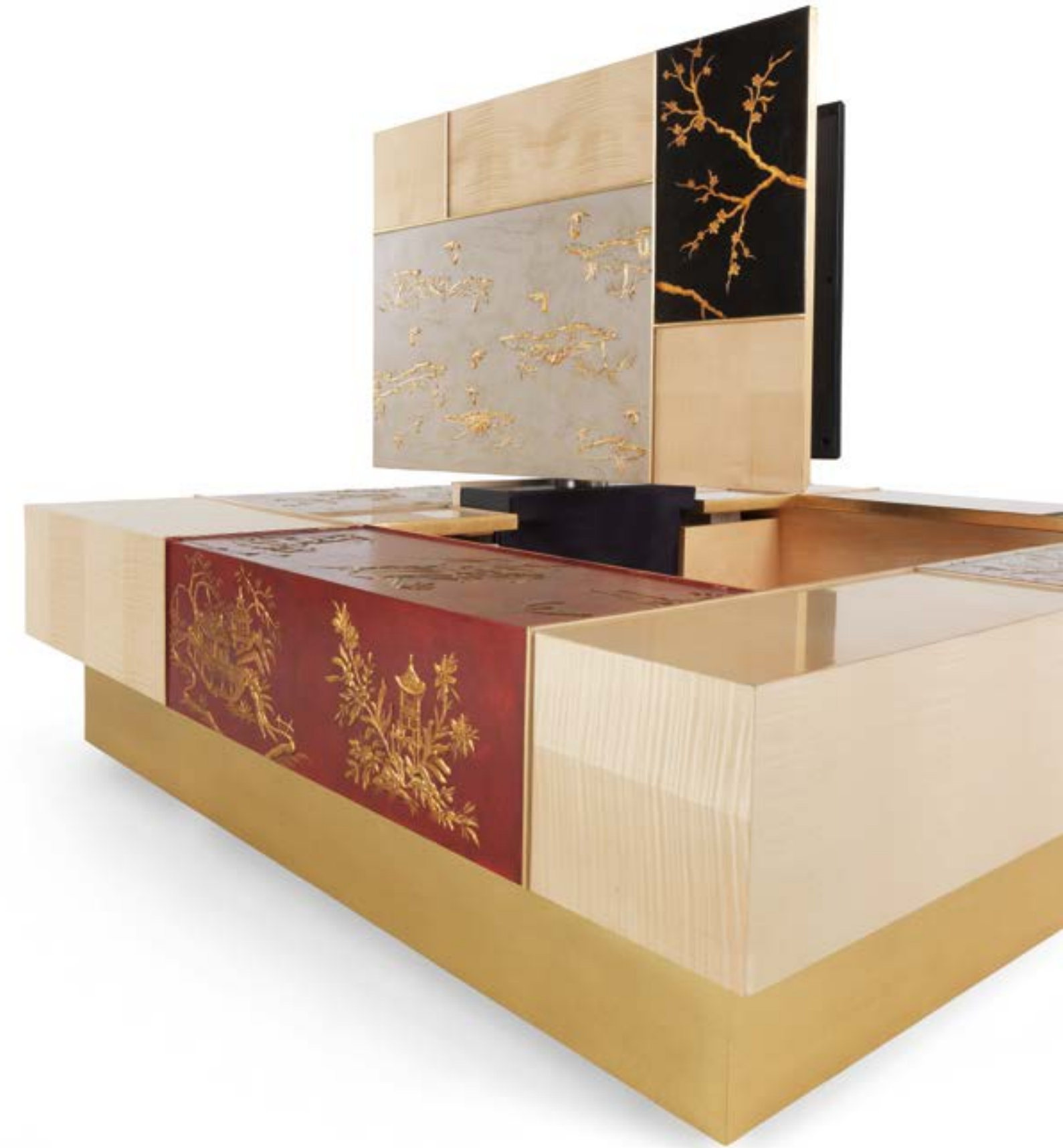
UKIYO CENTRAL TABLE